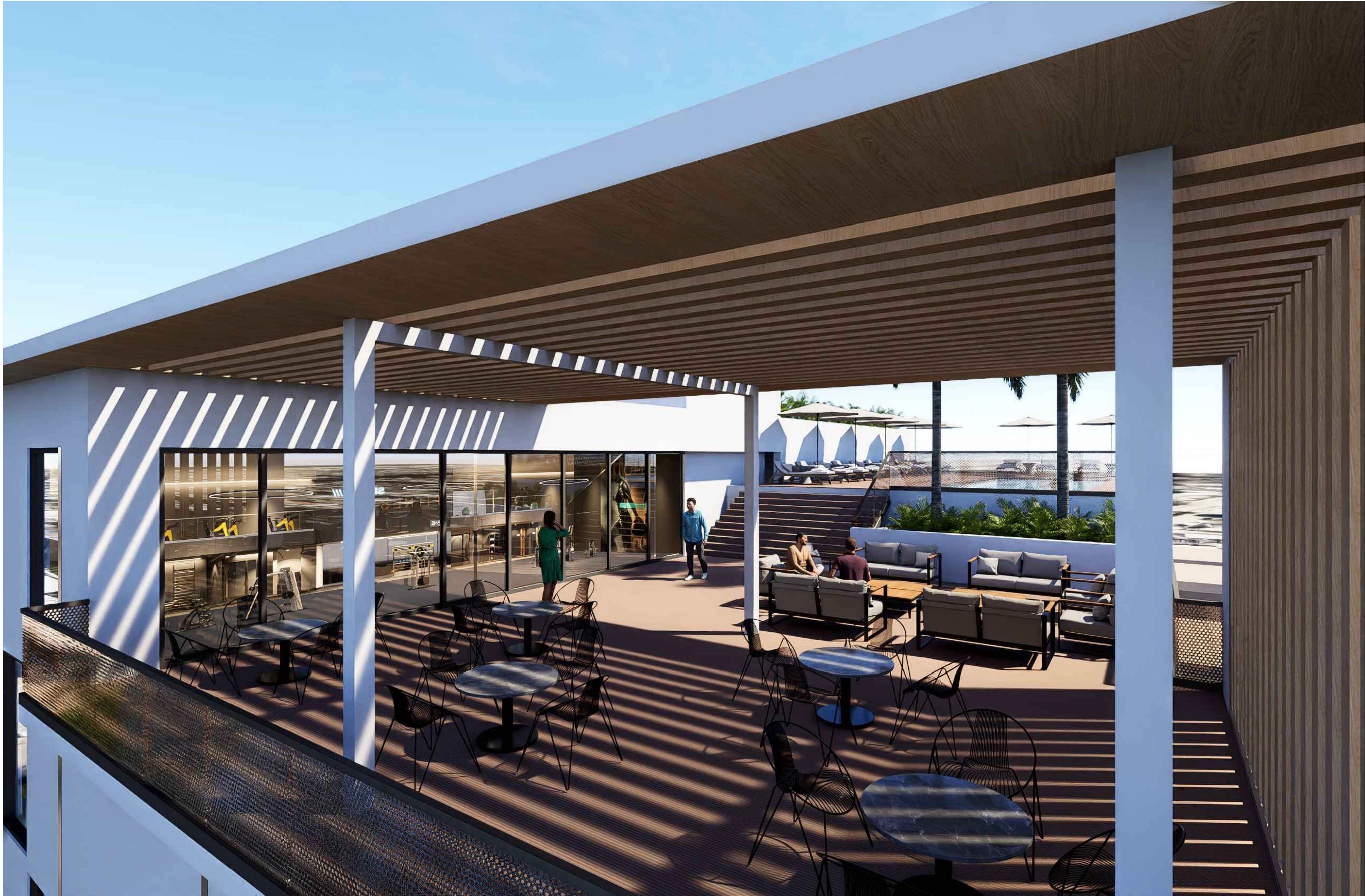
ZOOM-IN VIEW OF THE ROOFTOP TERRACE